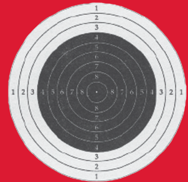
Actual size of an air rifle target

Perfect Match Score – A perfect match score of 600 is the maximum for air rifle.