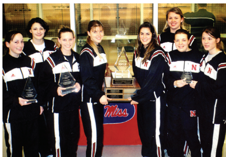
Nebraska earned GARC team championships in the 2004-05 and 2005-06 seasons.