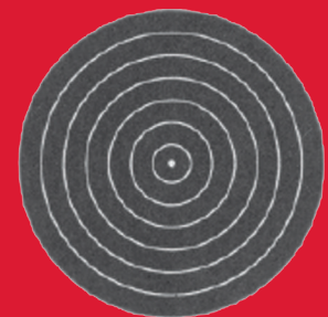
Actual size of a smallbore target

Perfect Match Score – A perfect match score of 600 is the maximum for smallbore.